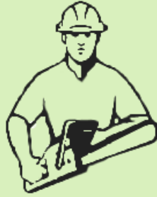
Tree Removal Cost Guide