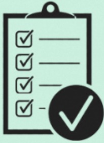
How to save on tree removal